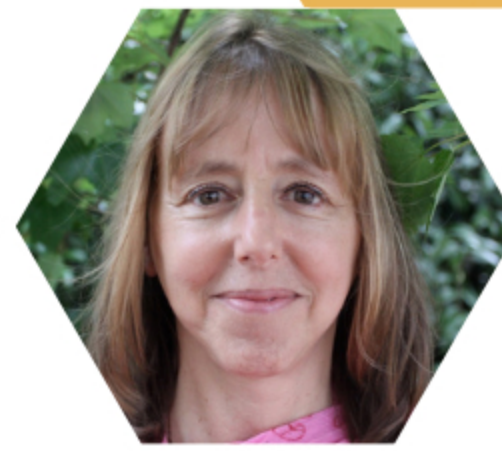
Medea Benjamin CODEPINK